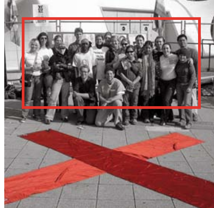
Target X action of IPPNW medical students

12.00 - 13.30h Lunch 13.30 - 15.00h Plenary III: Violence Prevention and promotion of health and development – a medical and moral imperative / The IPPNW "Aiming for Prevention" Programme , Ambassador T. Greminger, Foreign Ministry Switzerland; Dr. D. Hanson, Pres. of World Medical Assoc. (invited); K. Bartholomeos, Dpt of Violence and